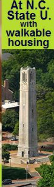
At N.C. State U. with walkable housing